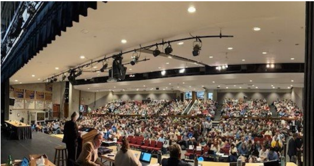
Photo of attendees in the High School Auditorium During the May 6th Session

The 2024 Annual Town Meeting was held on May 6th and 7th, during which 35 articles were discussed and voted upon. 2,579 residents participated in the May 6th session, setting a new record for Town Meeting participation. Four large spaces at Acton Boxborough Regional High School were utilized to host the May 6th session, ensuring all attendees had space to participate and vote. The May 7th session was attended by 501 residents who participated in the remaining articles. I want to thank the Select Board for all their hard work and guidance leading up to and during the two-day session. I also want to thank the dozens of Town staff who worked tirelessly to prepare for Town Meeting and provide support for both nights ensuring the 2024 Annual Town Meeting was a success. A video of the meeting is available at ActonTV and the results of Town Meeting can be found by visiting www.actonma.gov/townmeeting [http://www.actonma.gov/townmeeting]