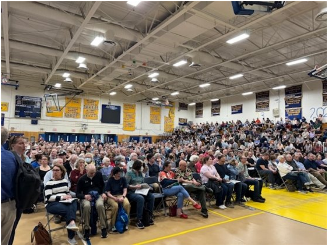
Photo of attendees in the High School Gym During the May 6th Session