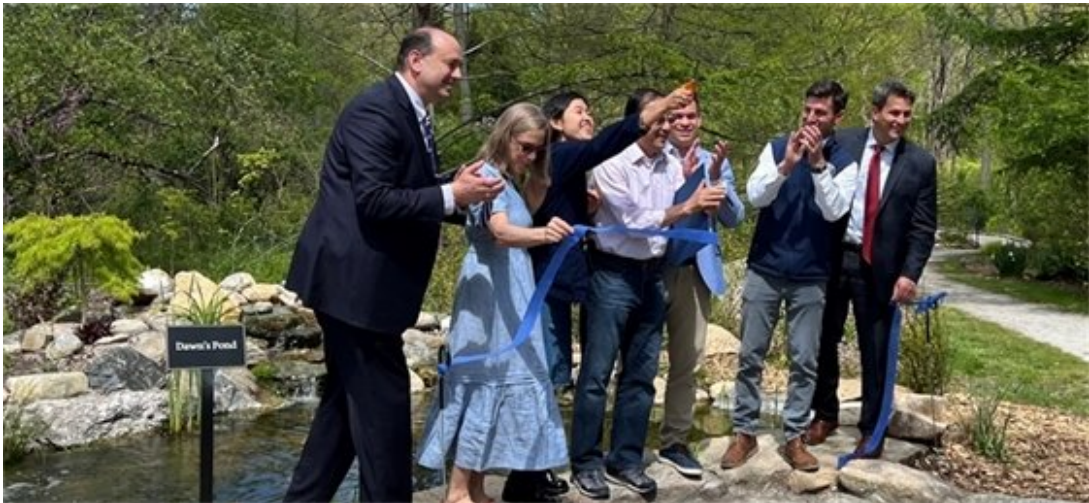
Photo of ribbon cutting ceremony