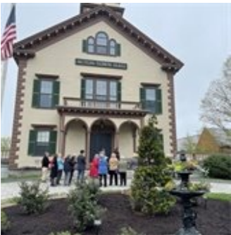
Picture above is the Town Hall Oval Garden dedication ceremony

On May 1st the Town Hall Oval Garden Dedication was held, honoring the work and generous gift from the Acton Garden Club. This event begins the start of the Acton Garden Club’s 90th anniversary celebrations as well, which will continue throughout the year. I want to thank the Garden Club for their hard work and generous donation of a beautiful Jenks fountain, which can be seen in the photo below. Please be sure to visit the Acton Garden Clubs website for more events throughout the year -