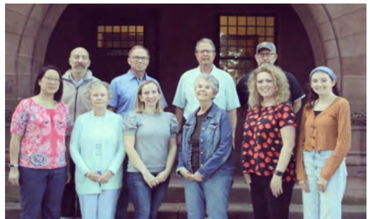
Thank you - to all our book donors, and volunteers! From the Board of the Friends.

PLUS: we will be at the AB FARMERS MARKET this Sunday 10-1pm slinging cookbooks getting ready for the book sale in 2 weeks. Sign up to bake, or volunteer, or grab a book.