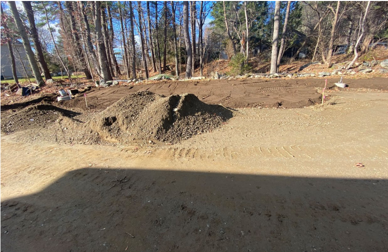
Preparation for pavement