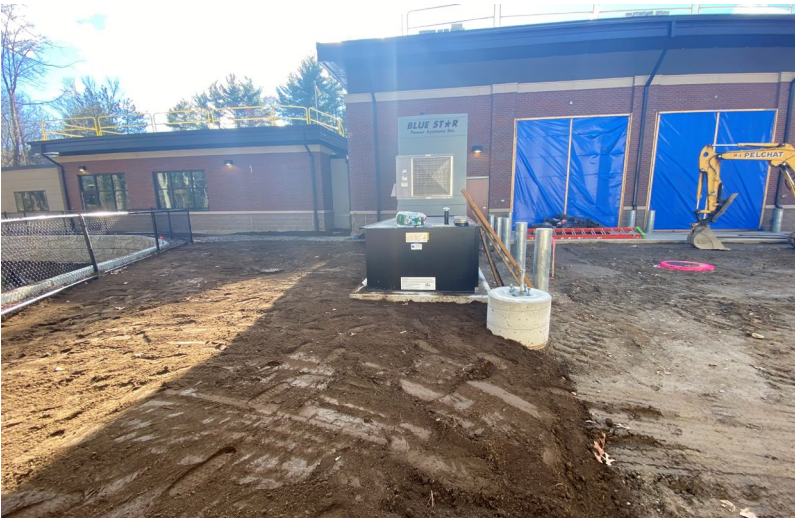
Overview of building from northeast