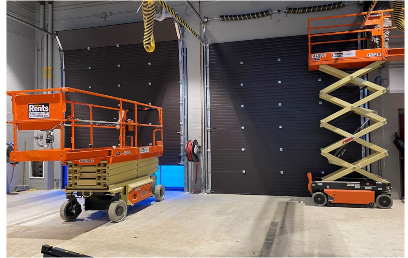
Overhead door installation