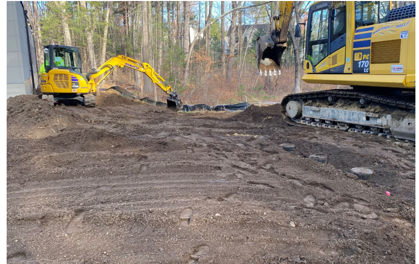
Preparation for pavement