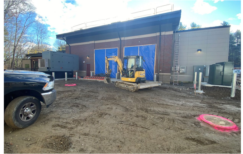
Overview of building from northwest