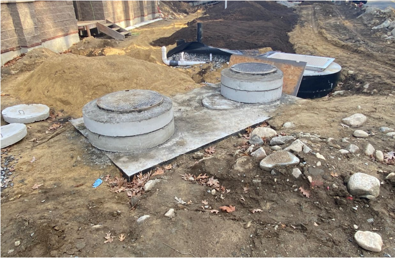
Septic system installation