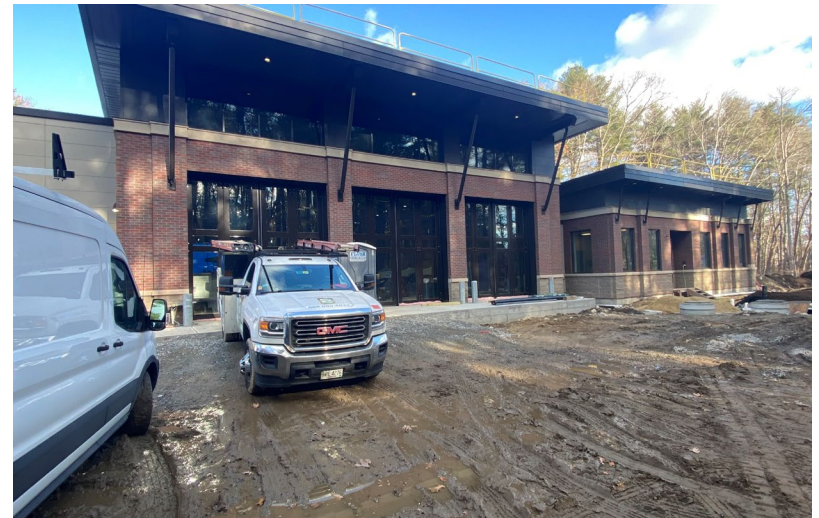
Overview of building from southwest