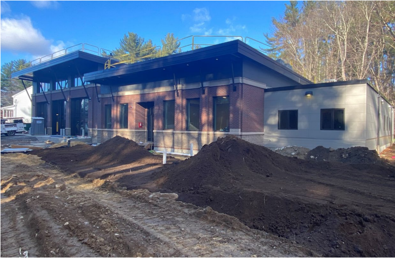
Overview of building from southeast