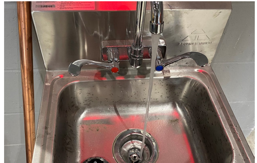
Water is on