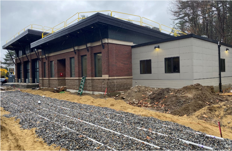
Overview of building from southeast