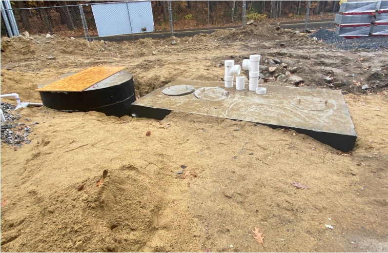
Septic system installation