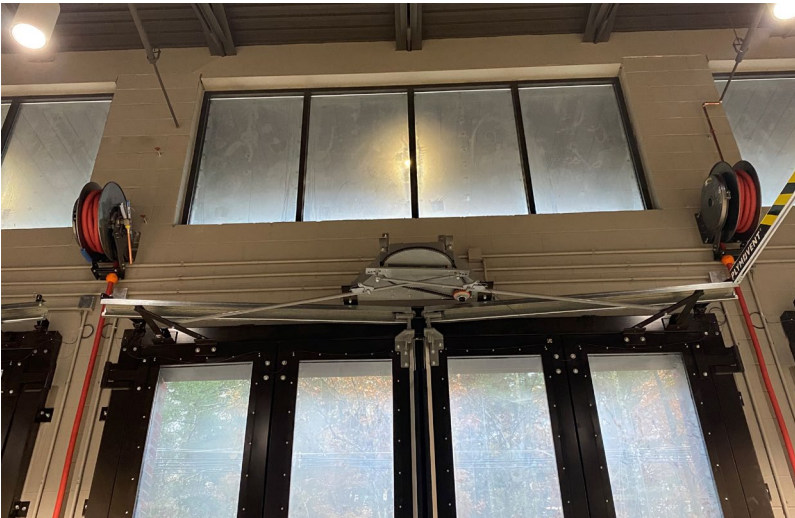
Water reel installation