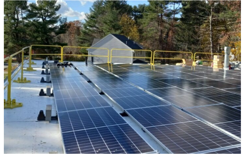
Solar system installation