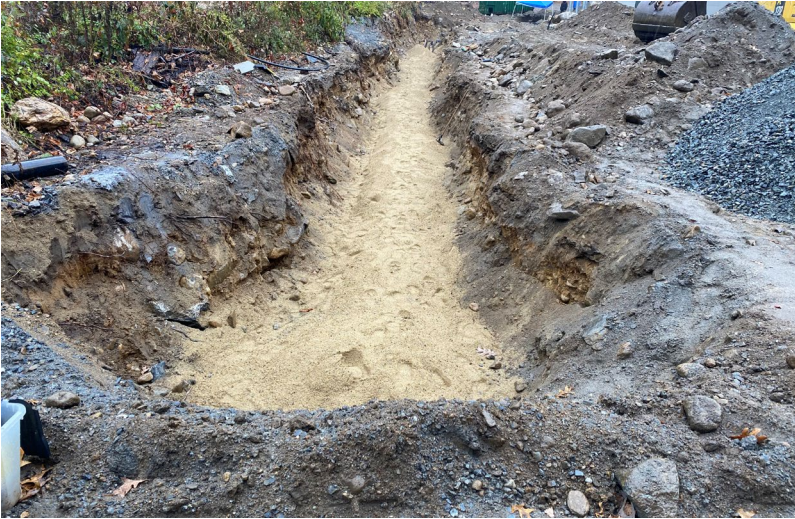
Geothermal loops installation