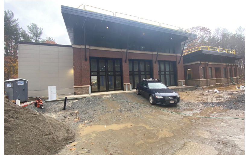
Overview of building from southwest