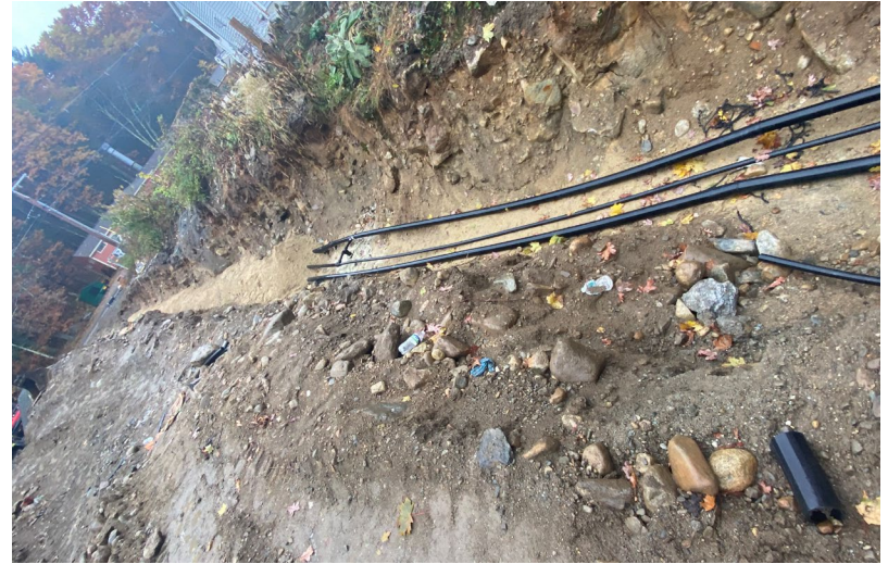
Geothermal loops installation