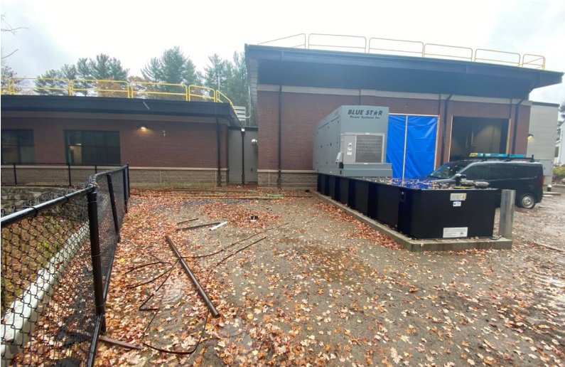
Overview of building from northeast