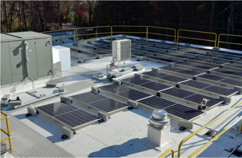
Solar system installation