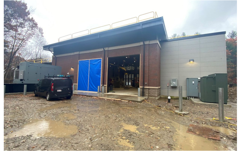
Overview of building from northwest