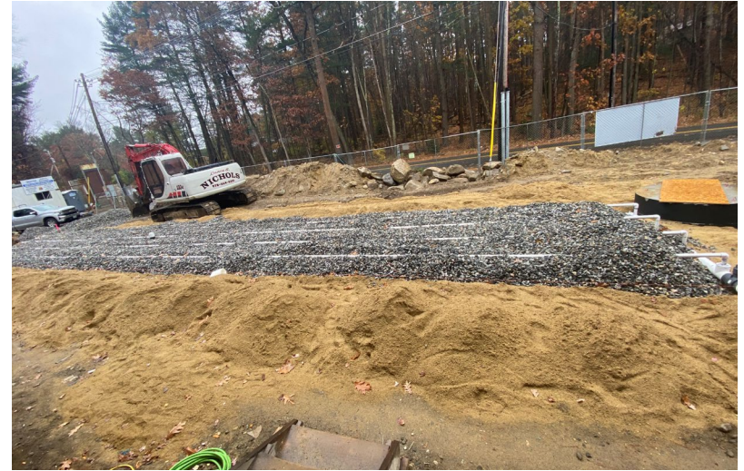
Leach field work