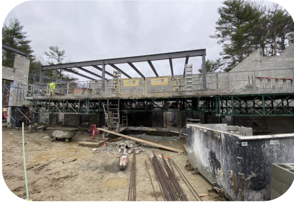
Masonry construction on western mezzanine