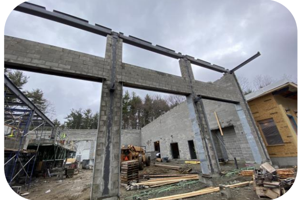
Southern apparatus bay exterior face