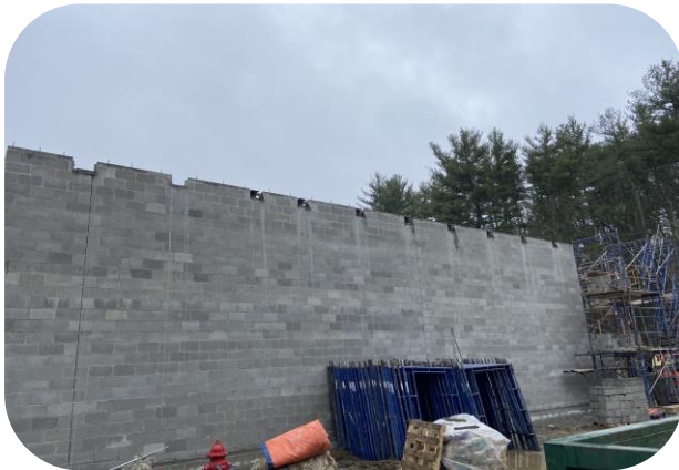
Masonry construction along west side of building