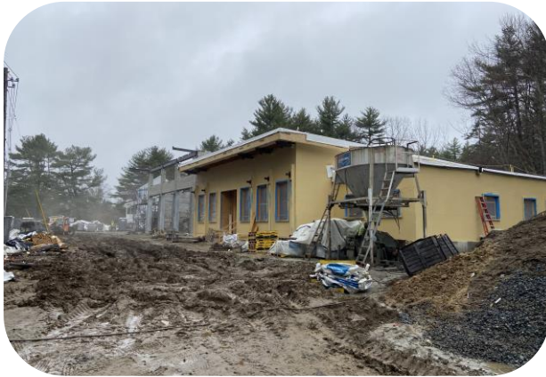
Overview of east side