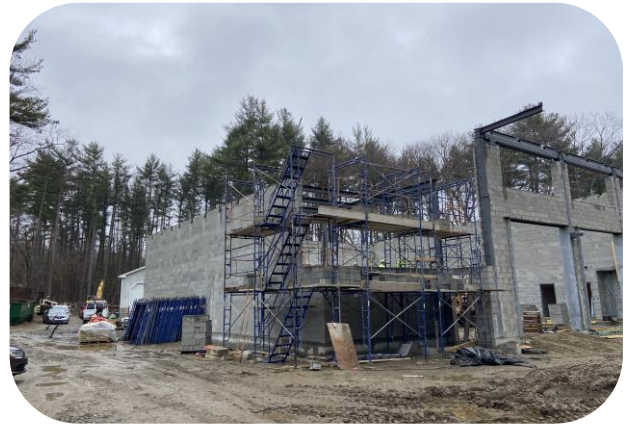
Overview of building from southwest side of site