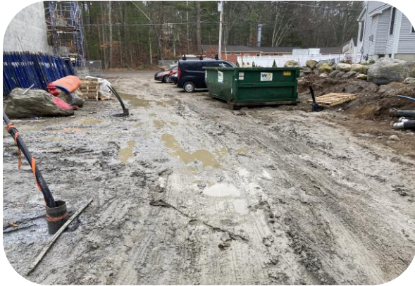
Grouted geothermal wells