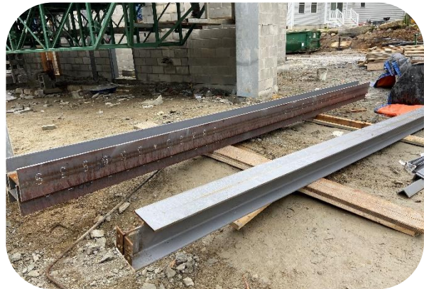
Western mezzanine steel beams