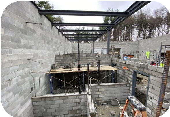
Overview of western mezzanine construction