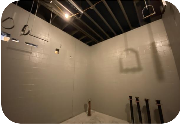
Painted mechanical room