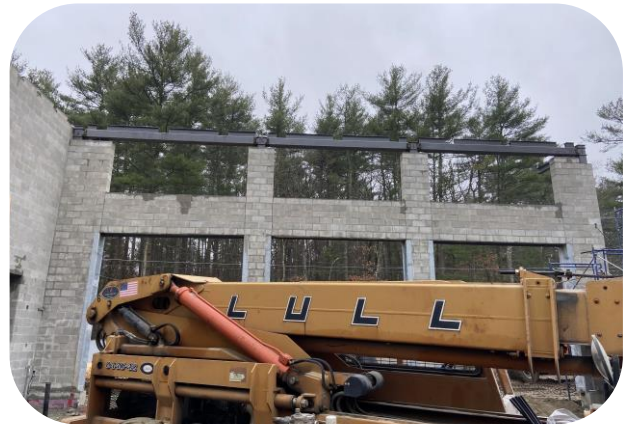
Overview of interior southern apparatus bay