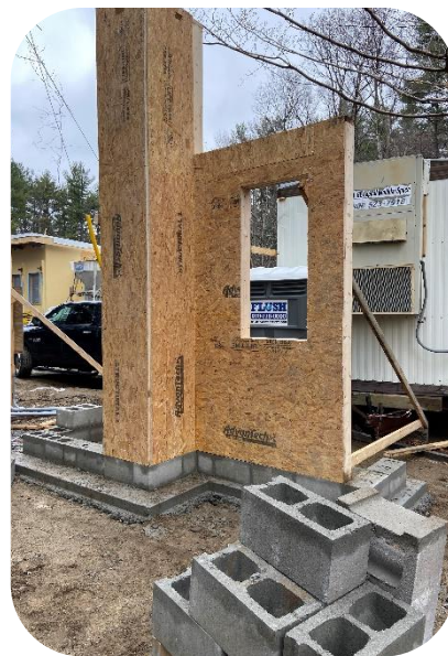
Mockup at job site trailer