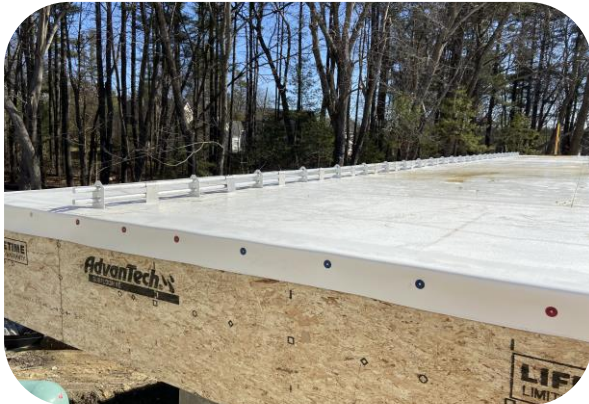
Snow fence on admin side sloped roof. Roofing installed (03.23.2021)