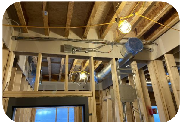
Wiring and HVAC rough-ins in bunk area