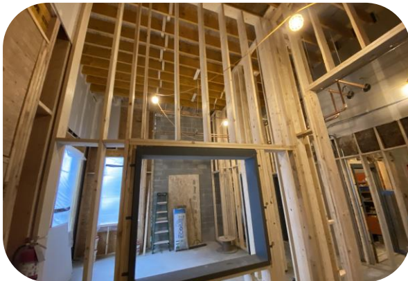
Interior framing at southern entrance