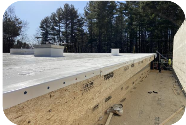
Roof hatch installed on admin side sloped roof. Roofing installed (03.23.2021)