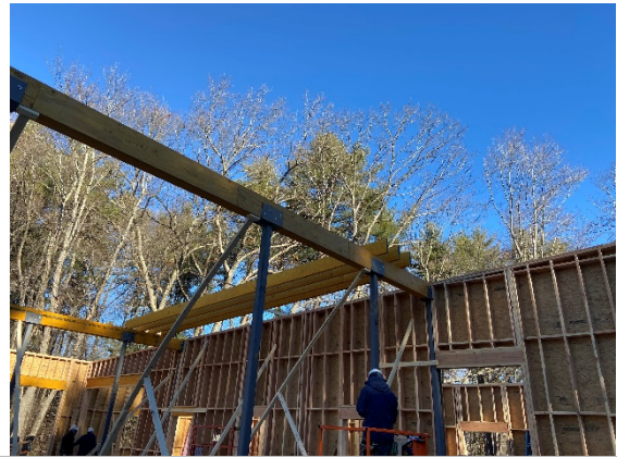
Installation of LVL joists (01/08/2021)