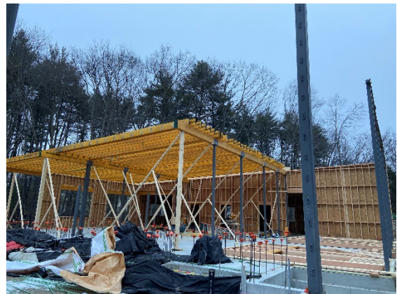
Interior and exterior wood framing installation (01/14/2021)