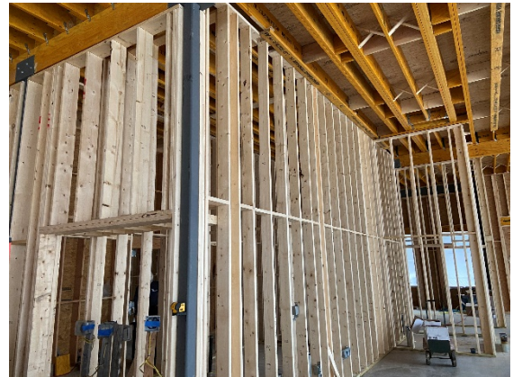
Interior wood framing (02/05/2021)