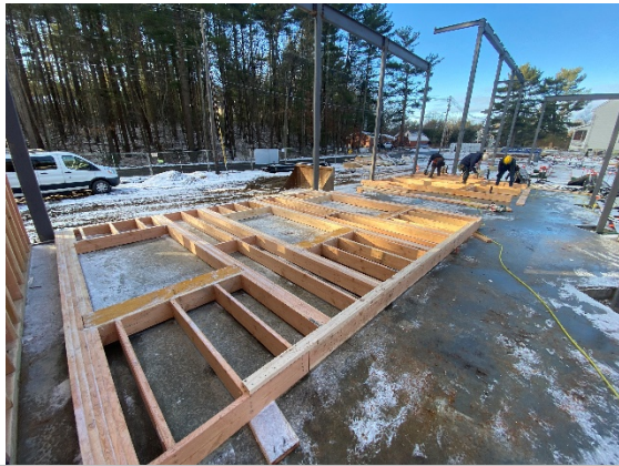
Construction of exterior wood framing (01/06/2021)