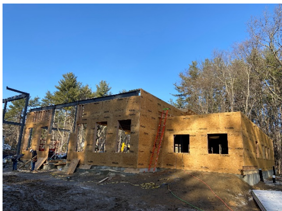
Interior and exterior wood framing installation (01/15/2021)