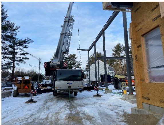
Picking for roof supplies (01/29/2021)