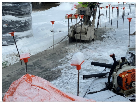
Saw cutting for insulation installation (01/27/2021)