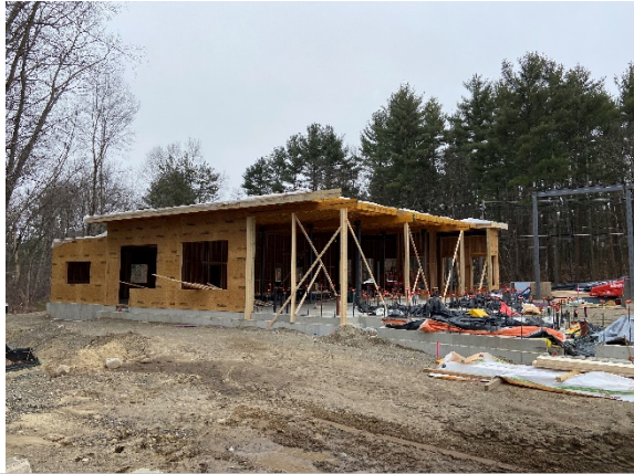
Interior and exterior wood framing installation (01/20/2021)