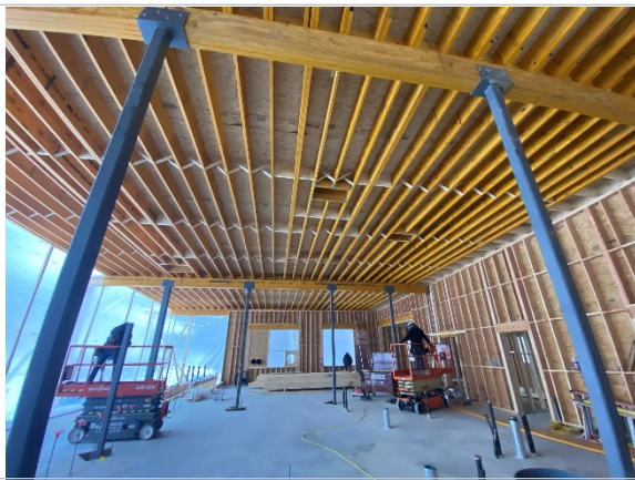
Interior wood framing installation (01/27/2021)