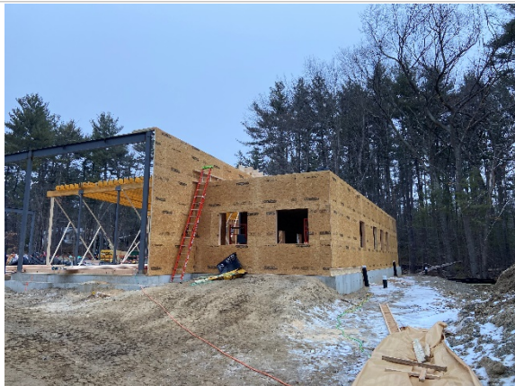
Interior and exterior wood framing installation (01/14/2021)