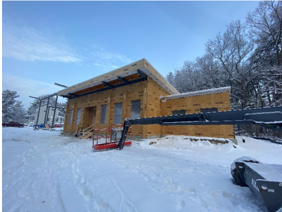
Overview of exterior wood framing (01/27/2021)