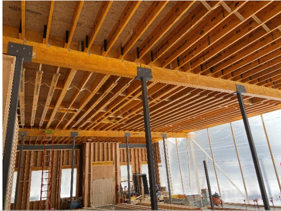
Interior LVL framing (02/03/2021)