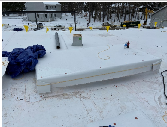
Waterproofing installed on LVL roof area (02/05/2021)