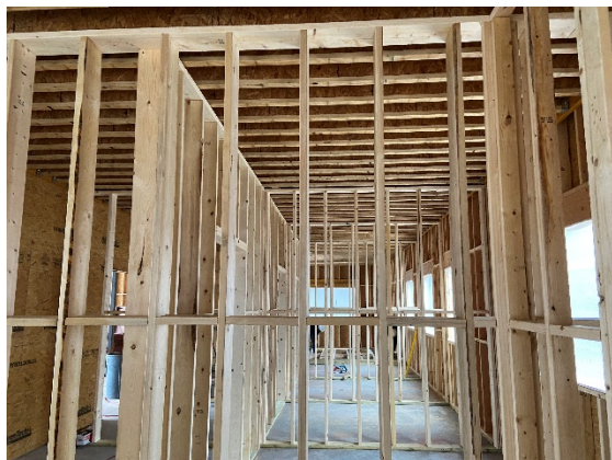
Interior wood framing installation (01/22/2021)