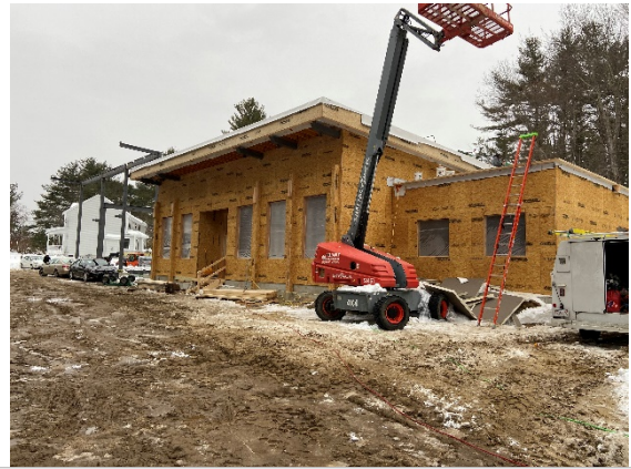
Overview of exterior wood framing (02/05/2021)