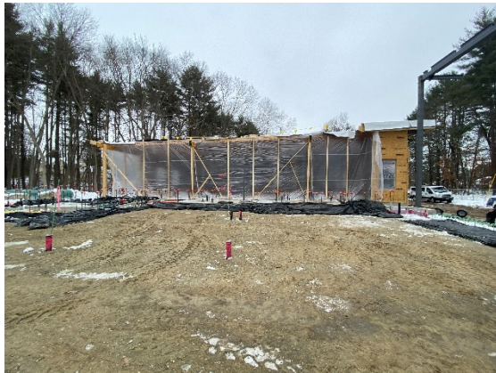
Overview of wood construction from west side of apparatus bay (02/05/2021)