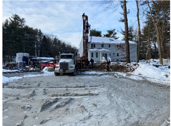
Geothermal well drilling (01/29/2021)