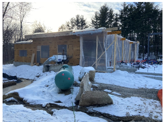
North side of wood construction (01/29/2021)