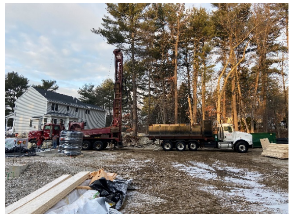
Start of geothermal well drilling (01/22/2021)