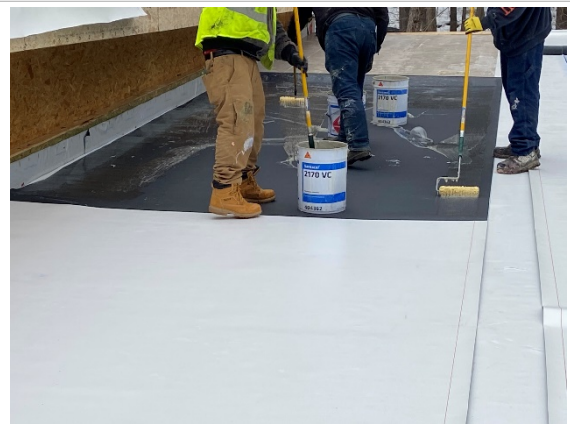
Installation of waterproofing over insulation on low roof area (02/05/2021)