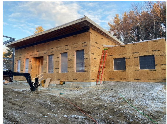
Exterior wood construction (01/22/2021)