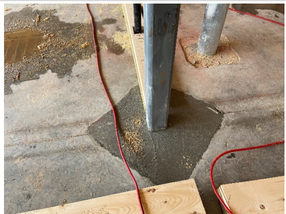
Interior column box slab poured (02/03/2021)